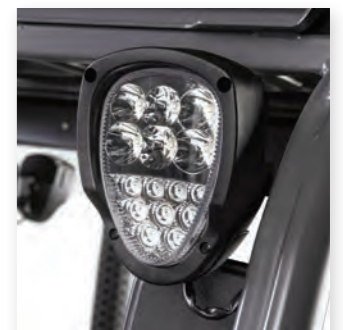
Floor Spotlights (optional)